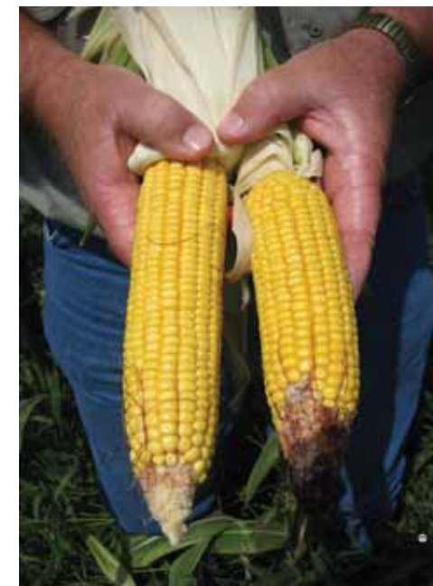
New technology protects against corn earworms (left) compared to a corn ear without in-plant insect control (right).